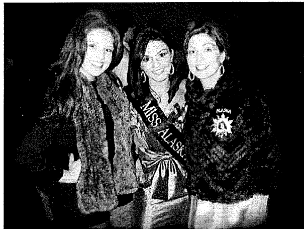
Miss Alaska, 2010